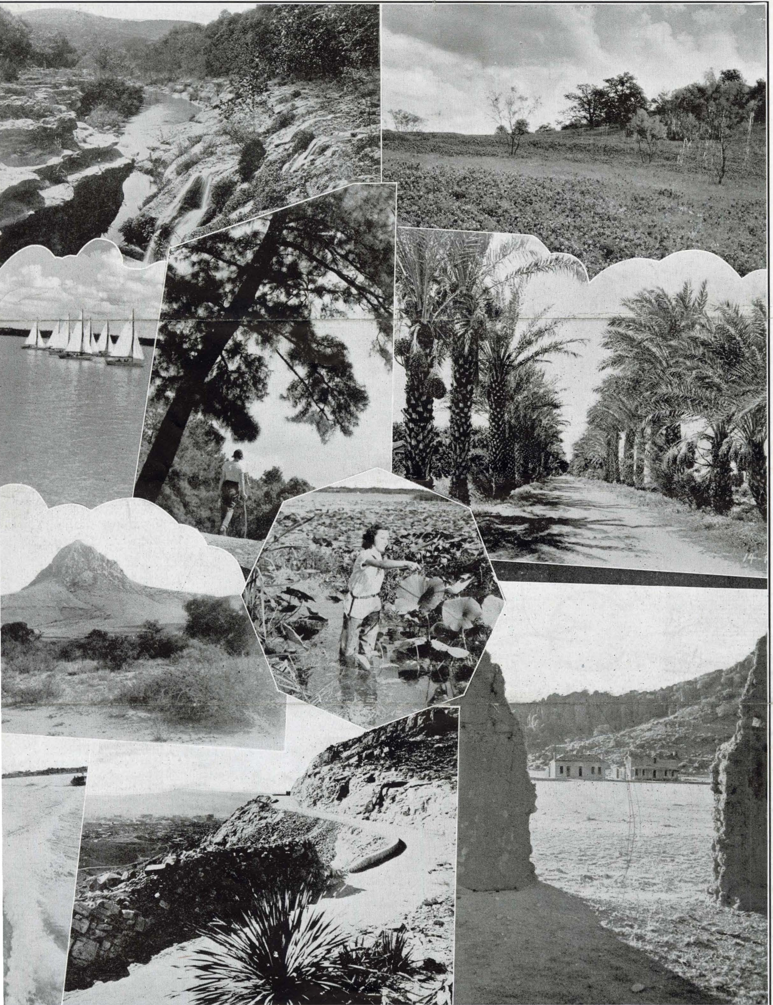
ons, the Big Bend country with its craggy peaks and mountain streams, the Rio Grande valley's tropical trees and flowers, the Gulf as Centennial Exposition in Dallas, June 6 to November 29, a foretaste of what there is to see along the state's highways.