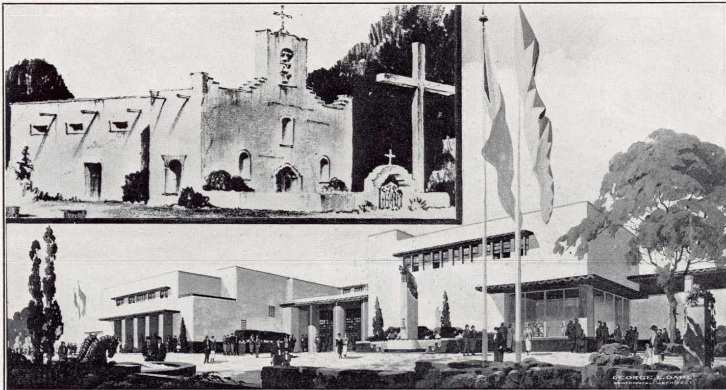
Upper left is pictured the replica of Texas' first church, erected in 1681, as it will appear on grounds of the Texas Centennial Exposition. The original church, located near El Paso, is San Miguel de Socorro del Sur. The other structure is one of the two Livestock Buildings which is being erected in the Farm Center of the Exposition.