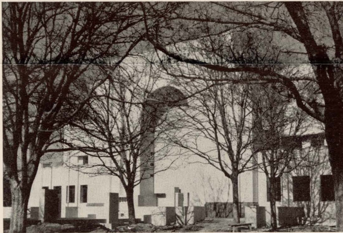
At left: Halls of Agriculture and Foods now, sketches (below).

Completions and near-completions of buildings at the $25,000,000 Texas Centennial Exposition have begun to give the busy 187-acre grounds a finished appearance. Along its avenues, though, new steel on new foundations show the expansion as more and more leaders of industry decide to take part. The Administration Building is shown, 98 per cent complete.