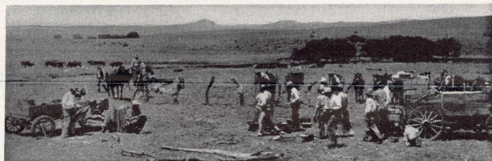
Branding season means home on the range

Straight north from Midland lie the staked plains—staked by Coronado as his expedition in 1541 pushed northwest, so he could find his way back, Indian guide or no guide. Northward the plains spread to the cap-