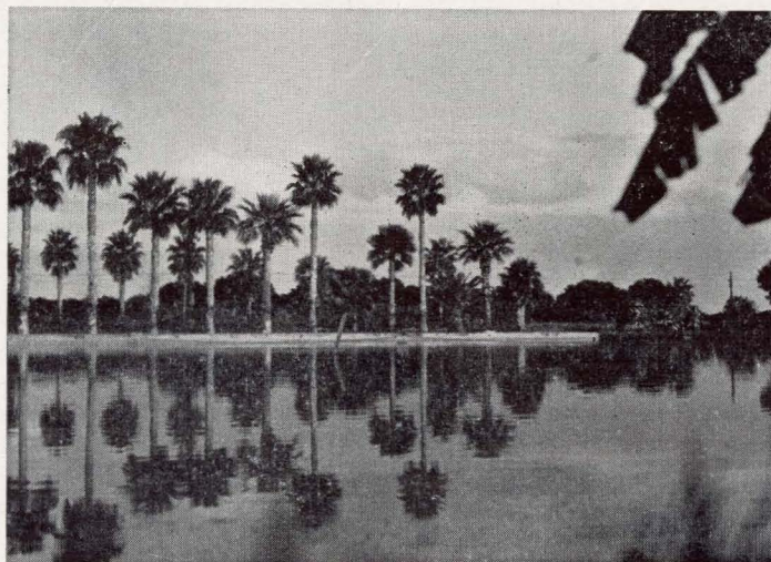
Palms Line Highways of Gulf Coast Plains

More sudden wealth to four counties and, in lesser quantities to half a dozen others, has come from oil, with 20,000 producing wells spreading across Rusk and Gregg and reaching over into Smith and Upshur counties to make the largest petroleum producing area in the world. Top quality oil lies 3,500 feet under formations through which drilling is easy, free of