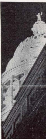
Dome of Capitol