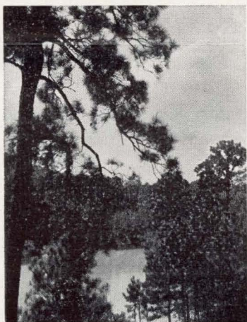
Tall Pines Stud East Texas

Richness of that red sand nurtures a great tomato-growing section, and watermelons—what