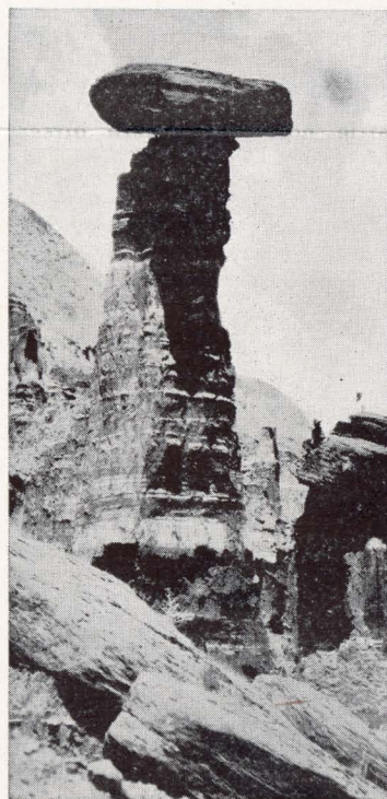
Devil's Tombstone, Palo Duro

And the Gray County meeting place of the pioneers is as far from Brownsville's new harbor as from New York to Chicago or Chicago to Denver; 953 miles.