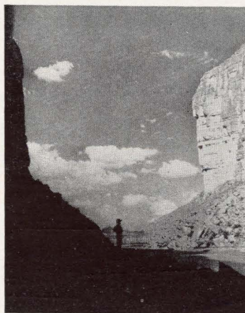
Santa Helena Canyon

From this section of the valley, routes by rail or highway